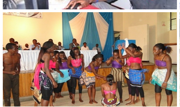
Literature skit performance during RRI sensitization