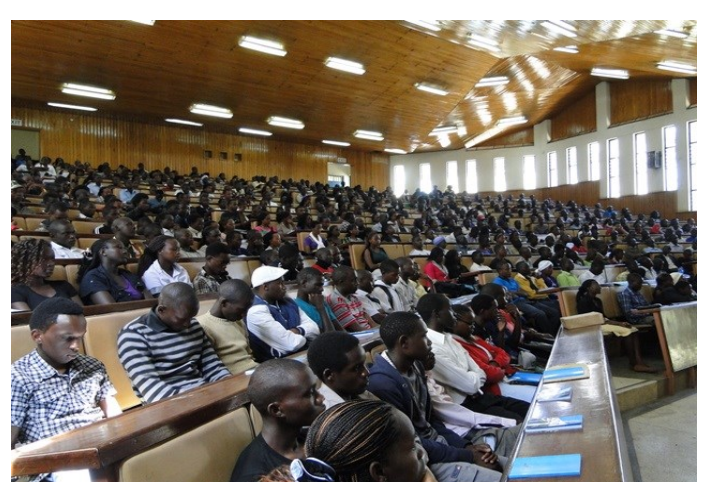
Orientation of first years

First year's registration process PICTORIAL COLLECTION FROM KAJIADO VISIT